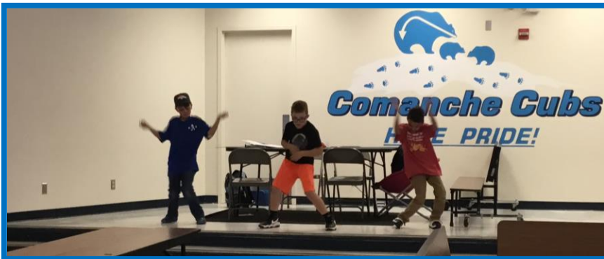
Boys Being Boys: Our Older Kids Area has been a popular place to just relax, play some games, or show off your sweet dance moves. The boys have been doing their best "Whip and Nae Nae." They have earned their own area by working diligently cleaning our community and being excellent role models.