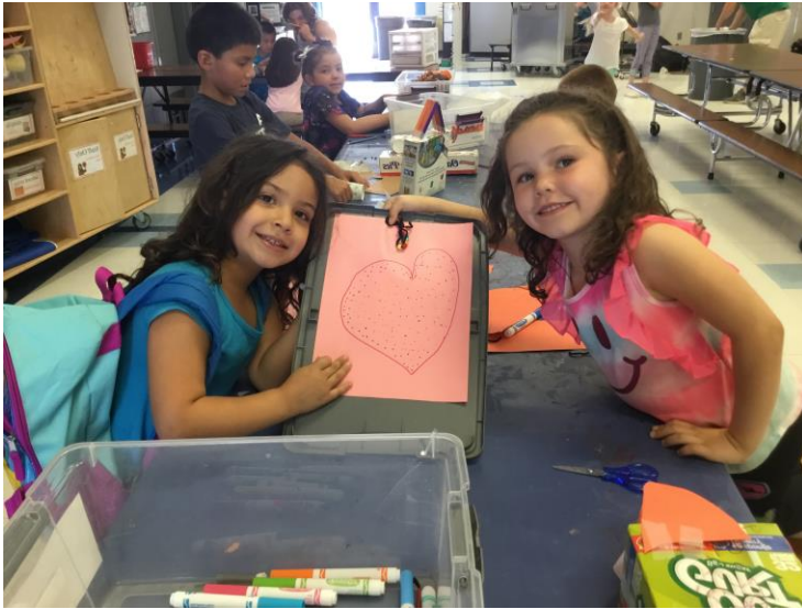
Making friends: Our Kindergarteners have jumped right into the swing of things. "I love my class and my friends!"