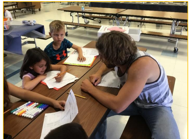
Here to Help: Our Homework Club has become quite popular. Kids are eager to get their work done, so they can relax and enjoy quality family time at home. "I want to finish my homework for the whole week."