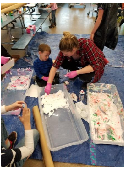
Look! We are turning into snowmen!