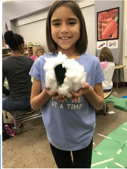
Sydney's last activity before leaving us was making Igloo homes. Using cotton balls, paper, and a lot of creativity, the kids came up with some neat results.