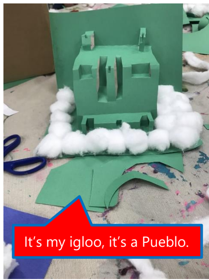
It's my igloo, it's a Pueblo.