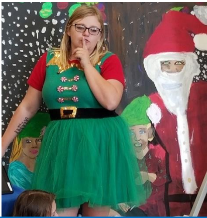
Your hands are so messy it looks like Paige ran this activity.