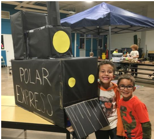
The bell still rings for all those who truly believe! -PE Check out the videos on our CC Facebook page!