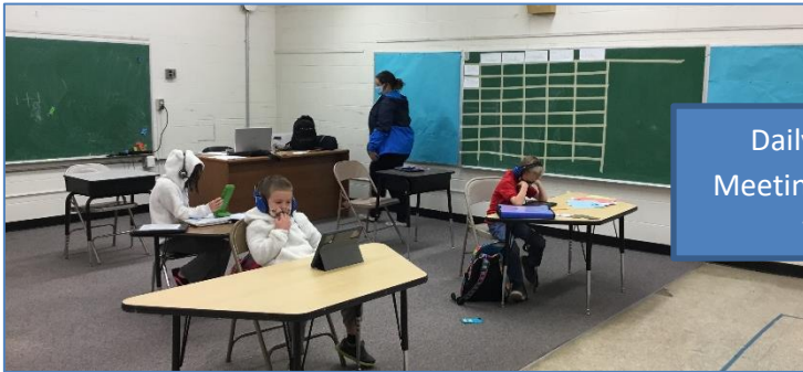
Daily Schedule for Meetings, Assignments, Tests, etc.