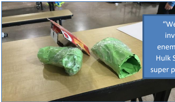
“We fight invisible enemies. My Hulk Smash is super powerful.”