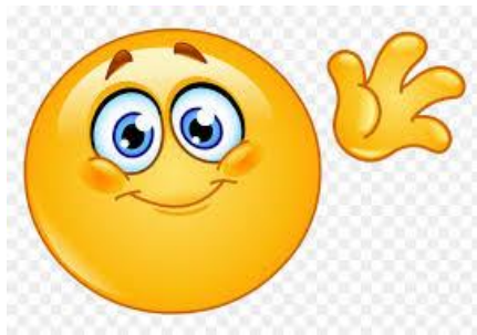
Cabin 8 Leader