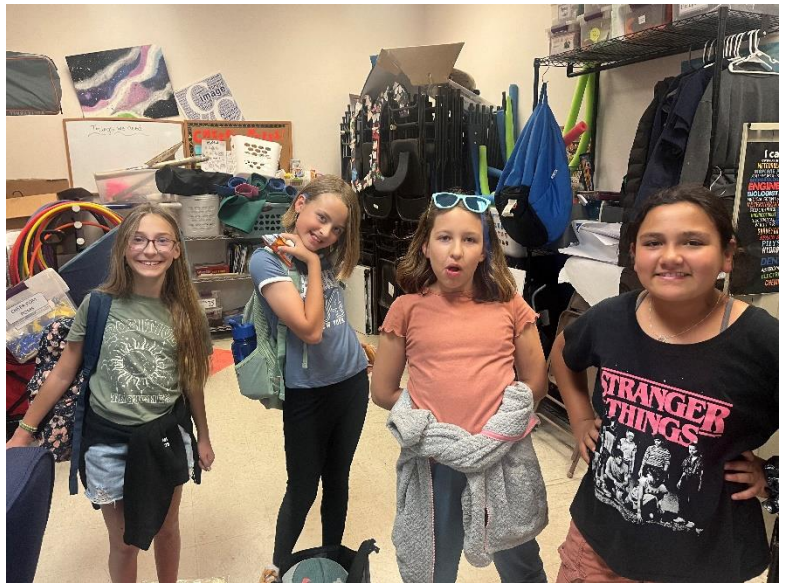
Fifth grade group pic